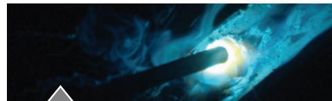
View with Jackson Safety ® ADF Helmet with Balder ® Technology