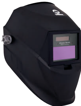
Black (VS) 287803