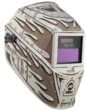
Metalworks™ (VS) 287810