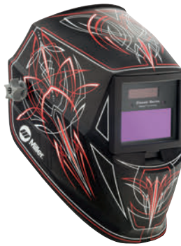
Rise™ (VS) 287815