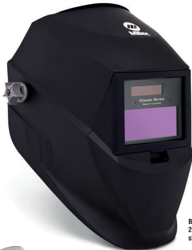
Black (VS) 287803 shown.

FS#10 Flip-Up: 14 oz. (396 g) VS: 16 oz. (454 g) VSi: 23 oz. (652 g)