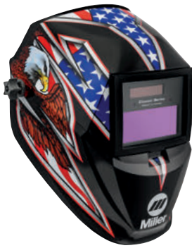
Liberty™ (VS) 287820