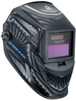
Metal Matrix™ (VS) 288519