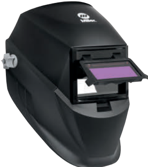
FS#10 Flip-Up 287798