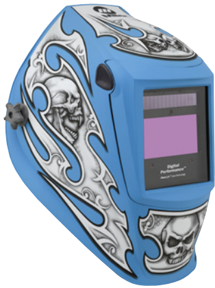
NEW! Crusher™ 282005