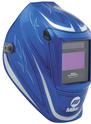
'64 Custom™ 282002