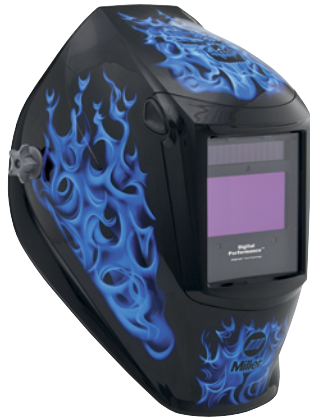
Blue Rage™ 282001