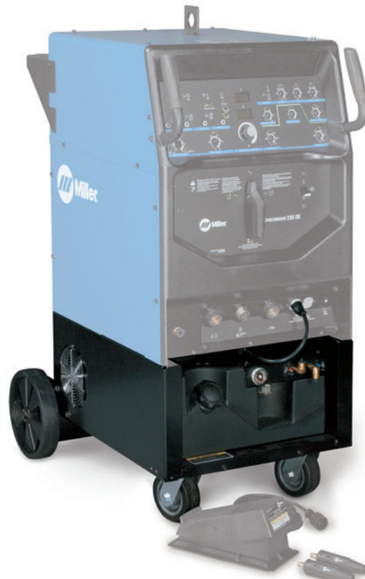
Coolmate 3X shown with Syncrowave® 250 DX TIGRunner®