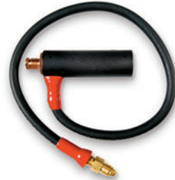
225028 50 mm thread-lock-style for water-cooled torch.