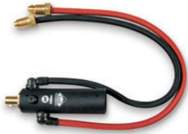
195380 50 mm Dinse-style gas thru with gas and water return lines for water-cooled torch.