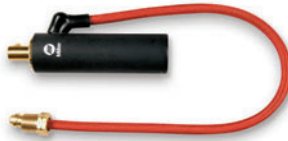
195377 50 mm Dinse-style with water return line for water-cooled torch.