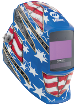
Stars and Stripes™ III 281002