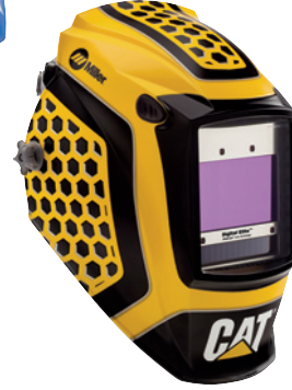
CAT® Cat® Edition 1 281006