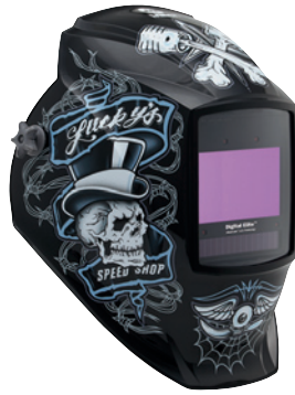
Lucky's Speed Shop™ 281001