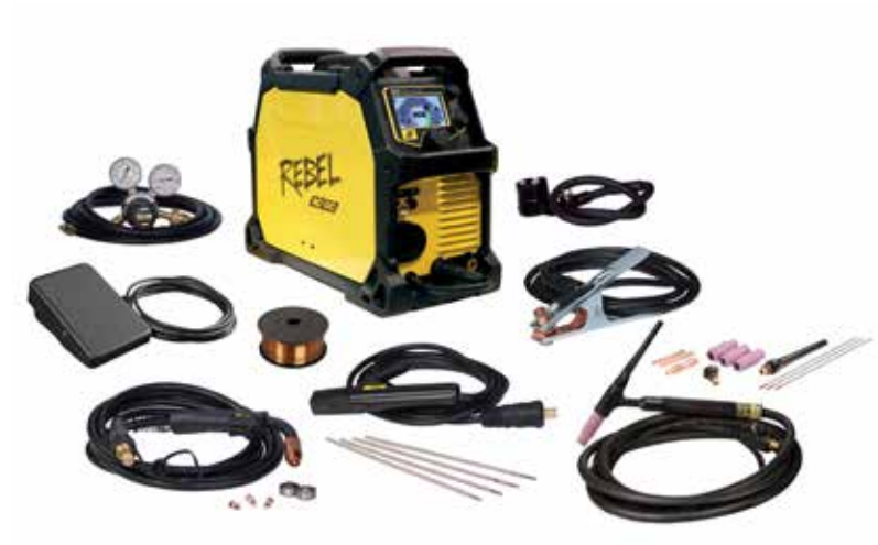
Rebel EMP 205ic AC/DC and accessories.